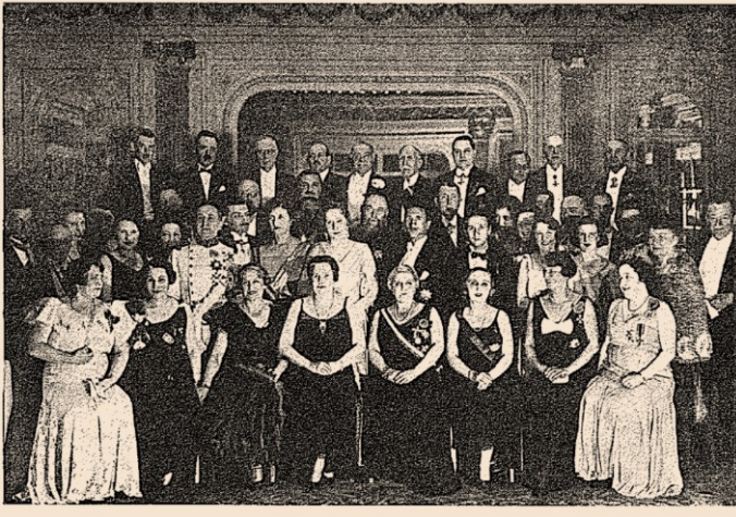
Group photograph including dame members of the Order Hôtel d'Iéna: 1933

A statutory reorganization carried out in 1935 enabled the admitted dames to enjoy the same status as the knights of the Order. 31 The 1948 statutory revision which forms the basis of the modern statute of the Order states that: 'In memory of the sisters of the ancient hospitals of St. Lazarus those ladies who satisfy the requirements of the relevant decrees may be admitted as Dames of the Order of St. Lazarus'. 32