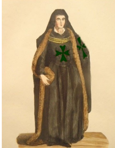
Female sister of the Order of St Lazarus ( artistic impression )