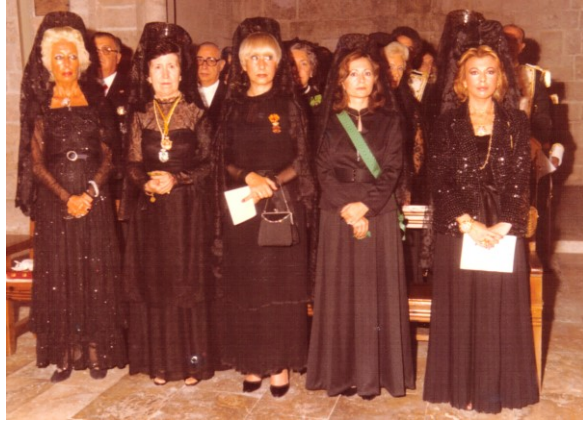
1970s Group photograph including dame members of the Order