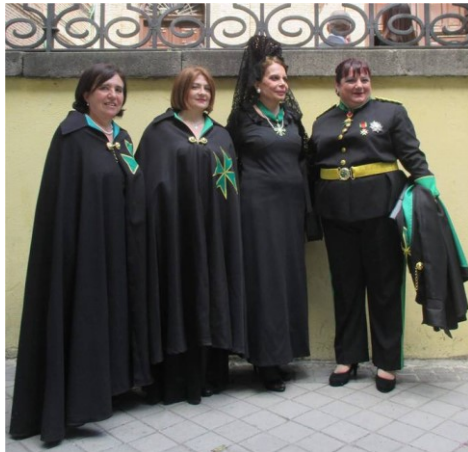
2018 Group photograph including female members of the Order